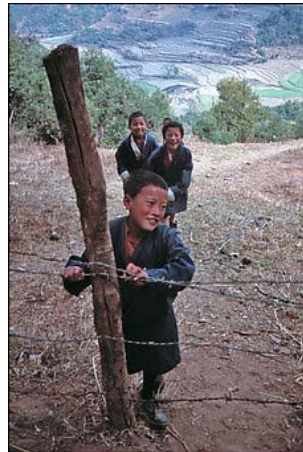
Children in the remote highlands of Bhutan